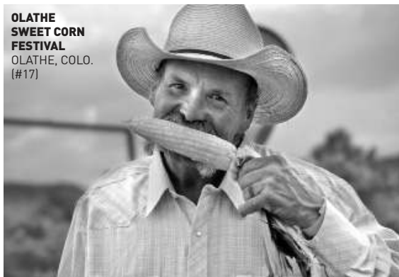
OLATHE SWEET CORN FESTIVAL OLATHE, COLO. (#17)

attitude" in shakes, ice cream, cheesecake, chocolates, and pancakes. When you're too stuffed to speak, listen to the contenders in the elk bugling contest. Last year's winners: kids who blew through the hose of a vacuum cleaner! huckleberryfestival.com