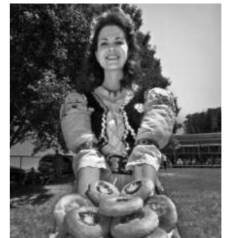
CZECH DAYS TABOR, S.D. (#14)