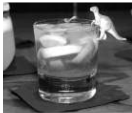
KENTUCKY BOURBON FESTIVAL BARDSTOWN, KY. (#7)

Minot, N.D. Sept. 27–Oct. 1 It's the continent's biggest Scandinavian festival, with crafts, folk dancing, and lots of Nordic grub, like klub (Norwegian potato dumplings), ponnukokur (Icelandic pancakes), and lutefisk (a pungent fish dish from Norway, Sweden, and Finland). hostfest.com