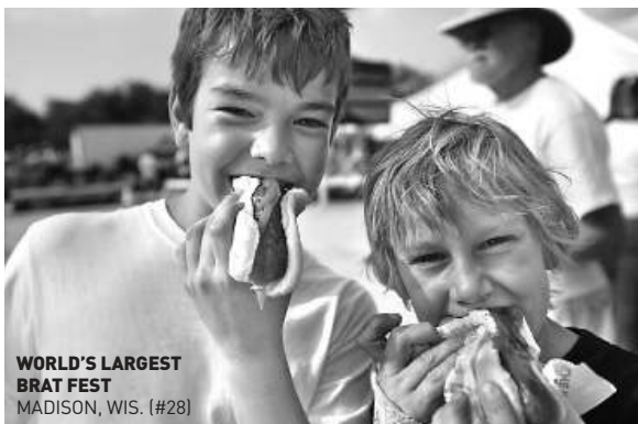
WORLD'S LARGEST BRAT FEST MADISON, WIS. (#28)

you can take part in tourneys of all types: artistic (best chicken hat), vocal (best cluck), athletic (rubber-bird chuck), digestive (hard-boiled-egg eating), anatomical (best chicken legs), and so on. chickenshow.com